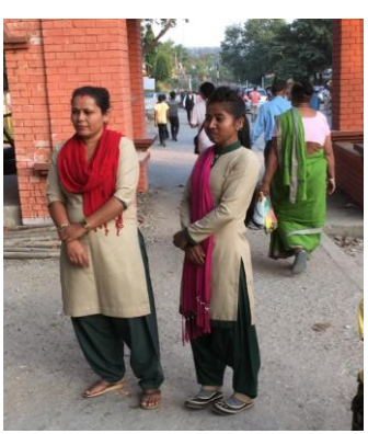
Border guards in Kavre and at the Indian border