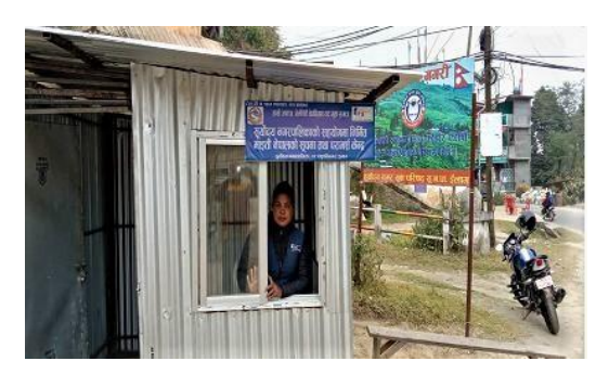
Another checkpoint with a border guard

In 2022, MAITI and the authorities also built a surveillance post at a large bus park near Pashupatinagar, close to a previously uncontrolled border crossing to India. Two border guards and border police officers have taken up their work here. This service is also financed by pro filia.