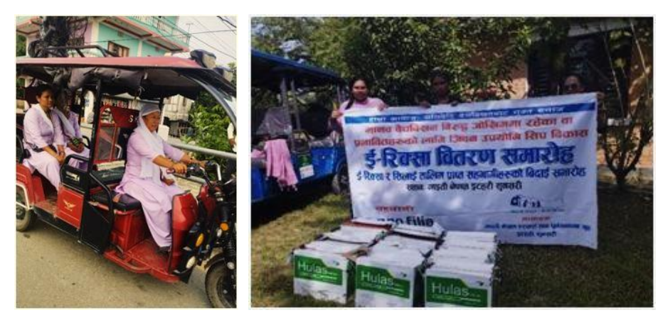
E-rickshaw driver with customers Replacement batteries for the e-rickshaws

During the last pro filia project visit, the young women complained that the rickshaw's battery ran flat very quickly and that they had to stop working then. It was agreed that the rickshaws would be re-fitted with two batteries. The costs for this were covered by pro filia in 2024.