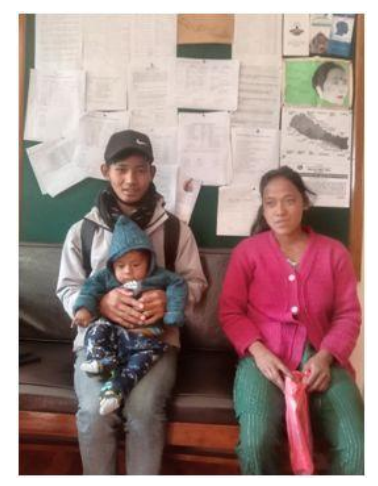
Girl is picked up by her brother