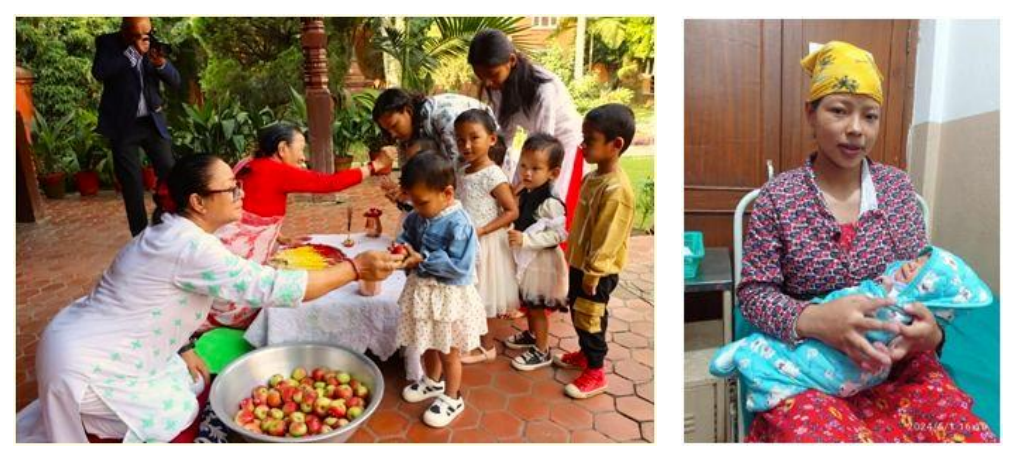
In the mother and baby home

There is virtually no help available in Nepal for this target group, single mothers and their newborn babies. How can a single mother look after herself and her infant after the birth? Traumatised, e.g. after rape, often abandoned by their families and without education or a job, they often have no other choice but to beg or prostitute themselves - and the misery continues from generation to generation! pro filia has committed itself to stop this cycle and to support as many as possible single mothers and their babies by setting up a programme for this group of people. MAITI provided us premises in a house on the premises in Kathmandu for this purpose. The home began its work in May 2019 with 10 places, each for 10 mothers and their babies, and has since been expanded according to need.