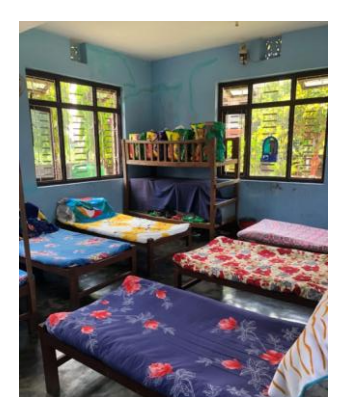
The Itahari rehabilitation centre

During our visits, many of the girls in our care express concern about their future. Most of them would like to earn their own money so that they can build a decent life for themselves. It is therefore especially important that pro filia does everything possible to provide further training as well as to fund start-ups. So, we help to create jobs or to set-up own small business - see projects 6 and 7.