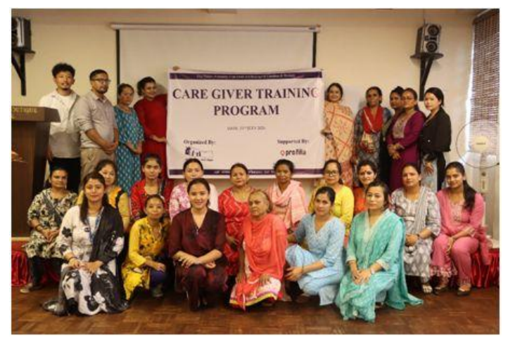
Further training for child carers

In 2024, three young women and their children lived permanently in the home. The girls are working and finishing school at the same time and their children are being looked after. There were nine new