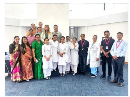
and "our" team