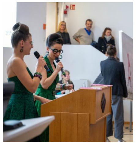
Zucchini Sistaz in action!