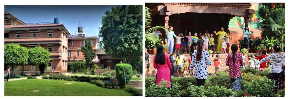
MAITI site in Kathmandu

MAITI is still our main contact in Nepal - an NGO (non-governmental organisation) that has been founded in 1993. Its target group are girls and young women who have been freed from brothels or those who are at risk of ending on the streets or in prostitution due to poverty, domestic violence or false promises. We keep close e-mail contact with the local staff and together we plan necessary (re)management measures. By 15th February each year, we are provided with a detailed report of each project as well as the previous year's finances. During our regular visits, we are accompanied by a senior MAITI employee who answers our questions on site. An interpreter is also part of the travelling group so that we can keep up discussions independently of MAITI. The next visit will take place in 2025.