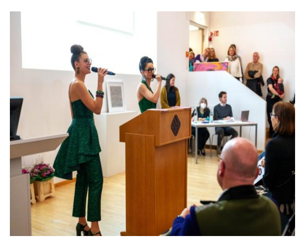
The Zucchini Sistaz as auctioneers